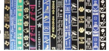
Imprint Ribbon see page 7