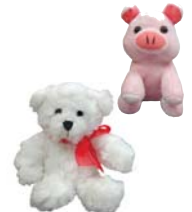
Plush see page 4