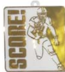
Score! Trinket see page 1